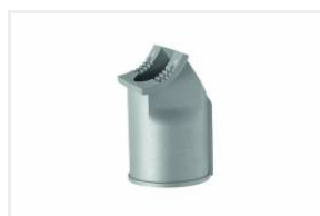
UCHWYT MONTAŻOWY 76MM (UL00141)